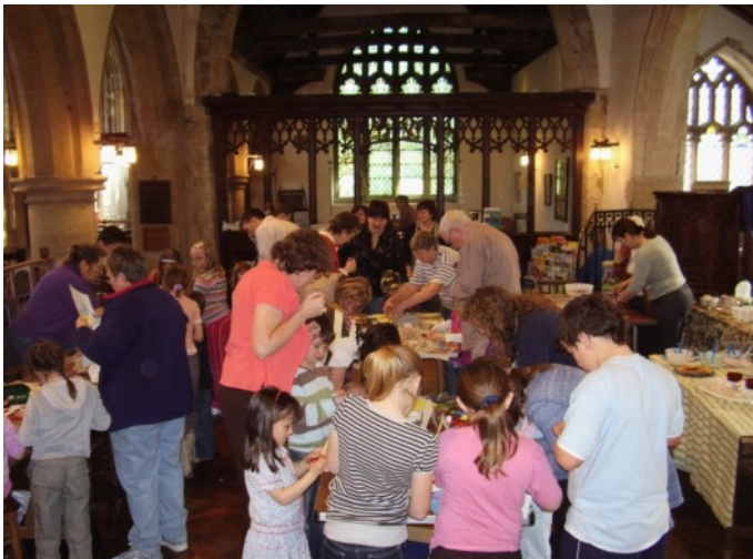
The picture is of one of our Children’s Activity Mornings at St Michael’s

Family Service once a month Giving money to other charities Lunches weekly in church Praying for individuals Services in care homes Youth Group weekly in term